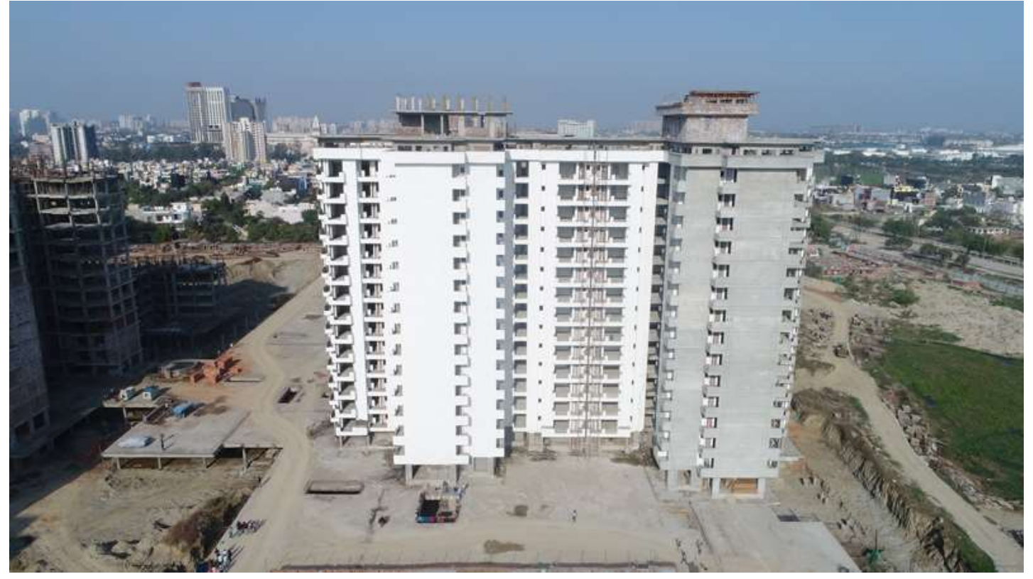
In block D-05 External Plaster work is in progress.